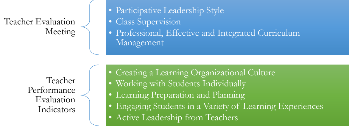
Figure 2. Focus Supervision of Teacher Performance Effectiveness

The effectiveness of teacher performance is always considered by the Head of Madrasah in order to optimize learning activities and maintain the achievement of educational goals. The homeroom teacher said that the process of supervising teacher performance is carried out once a month, and the Purpose is to maintain the integrity of the achievement of learning targets. This supervision is accommodated in the form of regular meetings attended by the head of the madrasah, deputy principal for curriculum, deputy principal for student affairs, and the entire teacher council. The Independent Curriculum's performance, teaching patterns, and achievement are the reasons for holding this teacher supervision and evaluation meeting. This evaluation meeting includes several things that need to be discussed together, and each teacher must be able to show their performance criteria according to teacher assessment indicators.